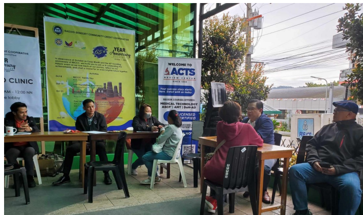
As part of the BBCCC's commitment to serve our local community, the BBCCC Conciliation and Mediation Committee organized a legal aid clinic on October 21, 2023, held at the BBCCC main building. This was done in collaboration with BBCCC officers in the legal profession. The services rendered were legal advice and simple document notarization for members and non-members of the BBCCC.