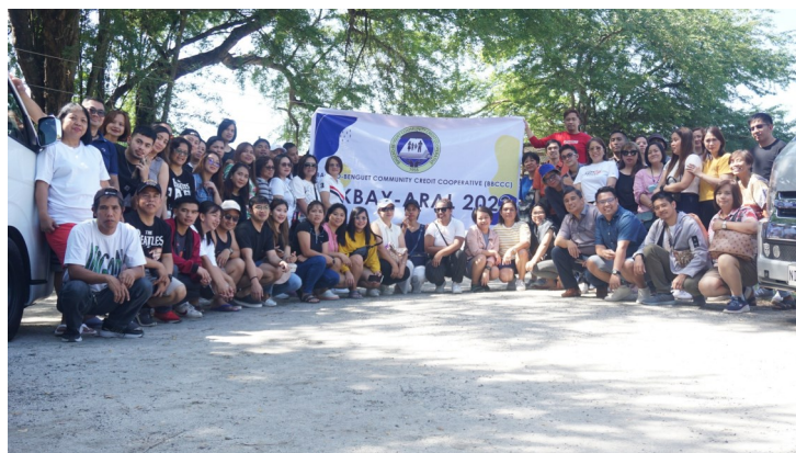
Photos taken during the Lakbay-Aral of BBCCC management and staff together with some Directors and Officers.

Benchmarking is truly an activity that drives officers and staff of the cooperative to meet more opportunities. An opportunity to enhance the cooperative's programs in the future. More detailed ideas for a broad plan for the success of the cooperative and readiness for the circumstances in which backups or reserves will continue the business without prior delays or failure to reach the goals of the cooperative.