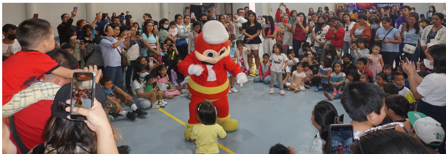
Photo taken during the BBCCC Family Day, October 8, 2023

Maligayang Pasko at Manigong Bagong Taon, BBCCC!!